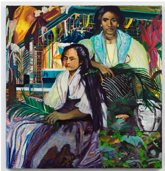
Magic Fire 2019 Oil on Canvas 52"x50"