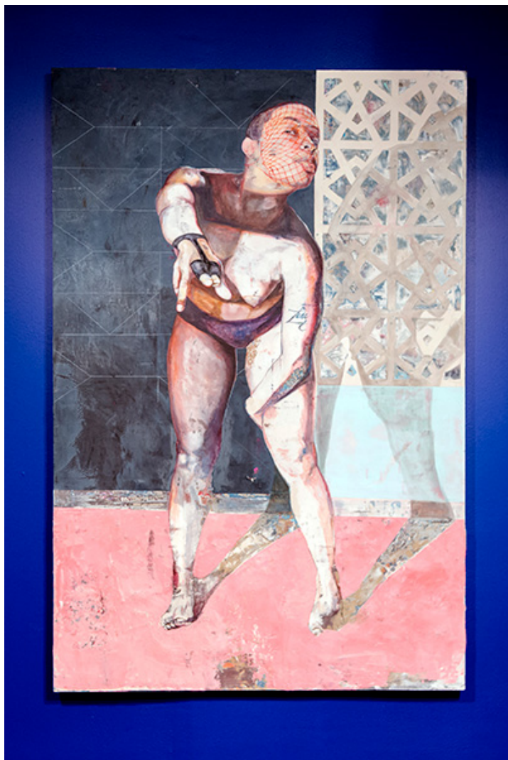
Open Carry 2018

Plaster, Pigment, and Acrylic on Birch Plywood 72"x48"x2"