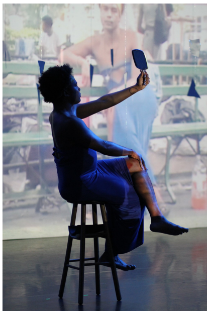
Reflections in BlaQ Updated 2019 Performance Installation View