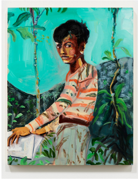
The Love Letter 2019 Oil on Panel 20"x16"