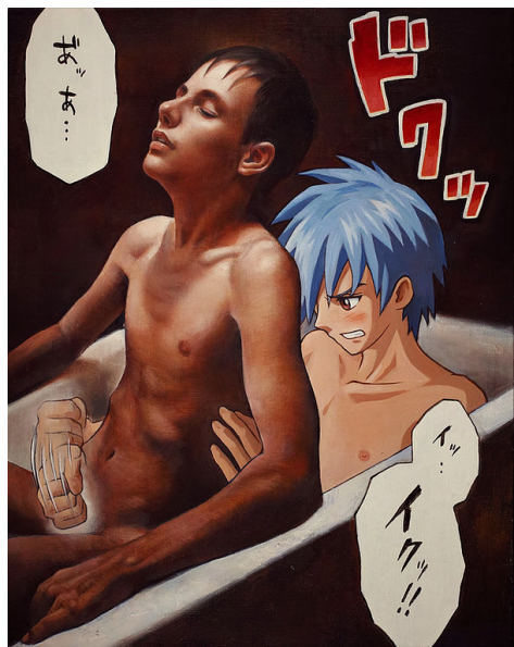
Virtual Bath Time 2019 Oil on Linen 20"x16"